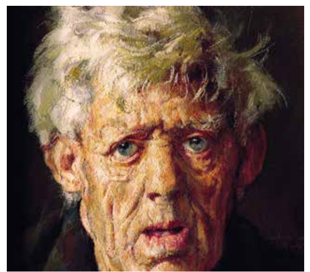
'Study of Old Snowy', 1979. 30 x 27 cm. Oil on canvas.

Lenkiewicz said, to an audience of old people: 'An open-eyed visit to an old folks home or hospital ward soon makes one lose patience with those who philosophize about the beauty of a green old age. Ageing is loss; it is not ripening.' He quoted a favourite Yiddish proverb: 'To die while young is a boon in old age.'